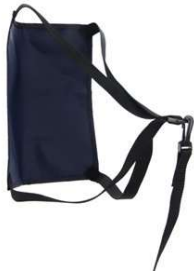
Parachute (Medium for Juniors and Large for Seniors)